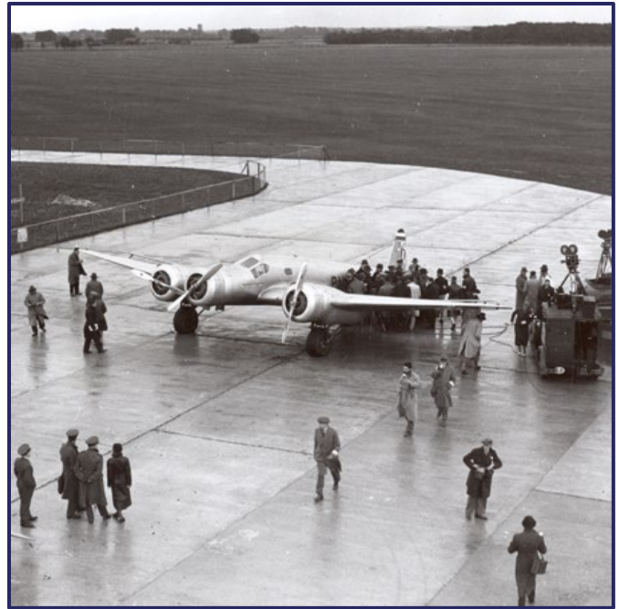
The MacRoberson Air Race

The government purchased land in 1929 and began construction in October 1930. The first official base name was RAF Beck Row, but that changed in 1933 to RAF Station Mildenhall. Contractors completed the first buildings in 1931. Three years later the station was ready for its official opening. RAF Station Mildenhall opened on October 16, 1934.