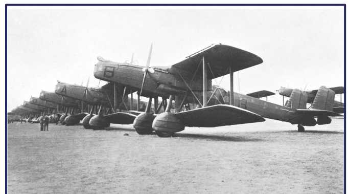
Heyford Night Bombers

RAF Mildenhall did not receive its first operational unit until November 15, 1934, when No. 99 (Madras Presidency) Bomber Squadron, arrived at RAF Station Mildenhall. Along with the No. 99 Squadron came the Heyford Night Bomber. The squadron re-equipped with Wellington Bombers in 1938 and left the station in March 1941. Its motto was QUISQUE TENAX (Each Tenacious).