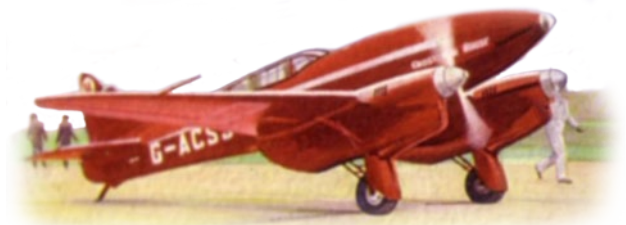
The De Havilland DH.88 Comet Grosvenor House, winner of the Air Race

The date for the dedication was, in part, due to the Royal Aero Club, who wanted to begin their England-to-Australia air race on October 20, 1934. The dedication, as well as the start of the MacRoberson Air Race from Mildenhall to Melbourne, Australia, drew 70,000 people to witness both events. Twenty aircraft began the race at RAF Station Mildenhall, but it was two Englishmen, who flew the 11,300 miles to Melbourne in 70 hours, 54 minutes and won the prize of £10,000.