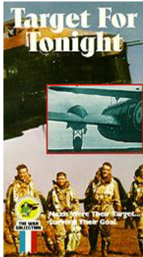
Advertisements for both movies